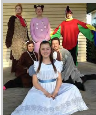
The Owl & The Pussycat